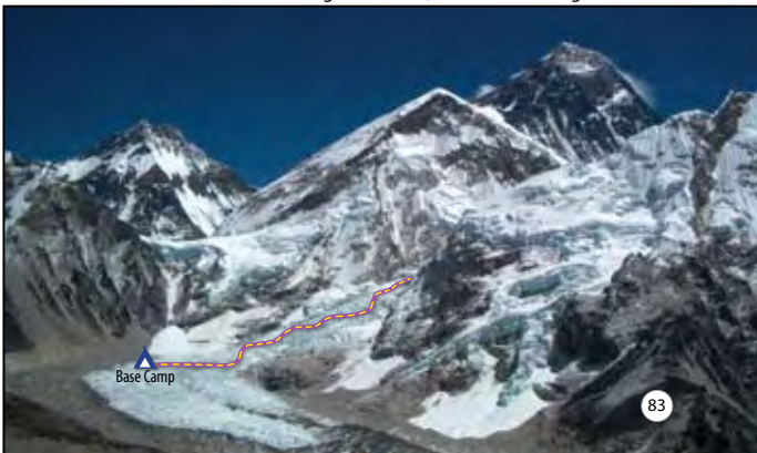
From Kala Pattar: the route starts through the Icefall, with Everest at right

Base Camp is located at the snout of the infamous Khumbu lcefall. Although not as jumbled as the lcefall, the BC area isn't very flat. Over the years, many good camping spots have been developed, and once the spring snow has melted it can be warm and pleasant here.